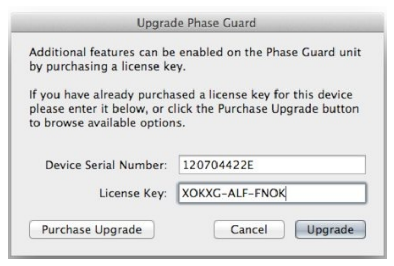
Figure 3 (License Key Entry)