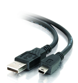
Figure 1 (USB cable)