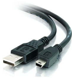
Figure 1 (USB cable)